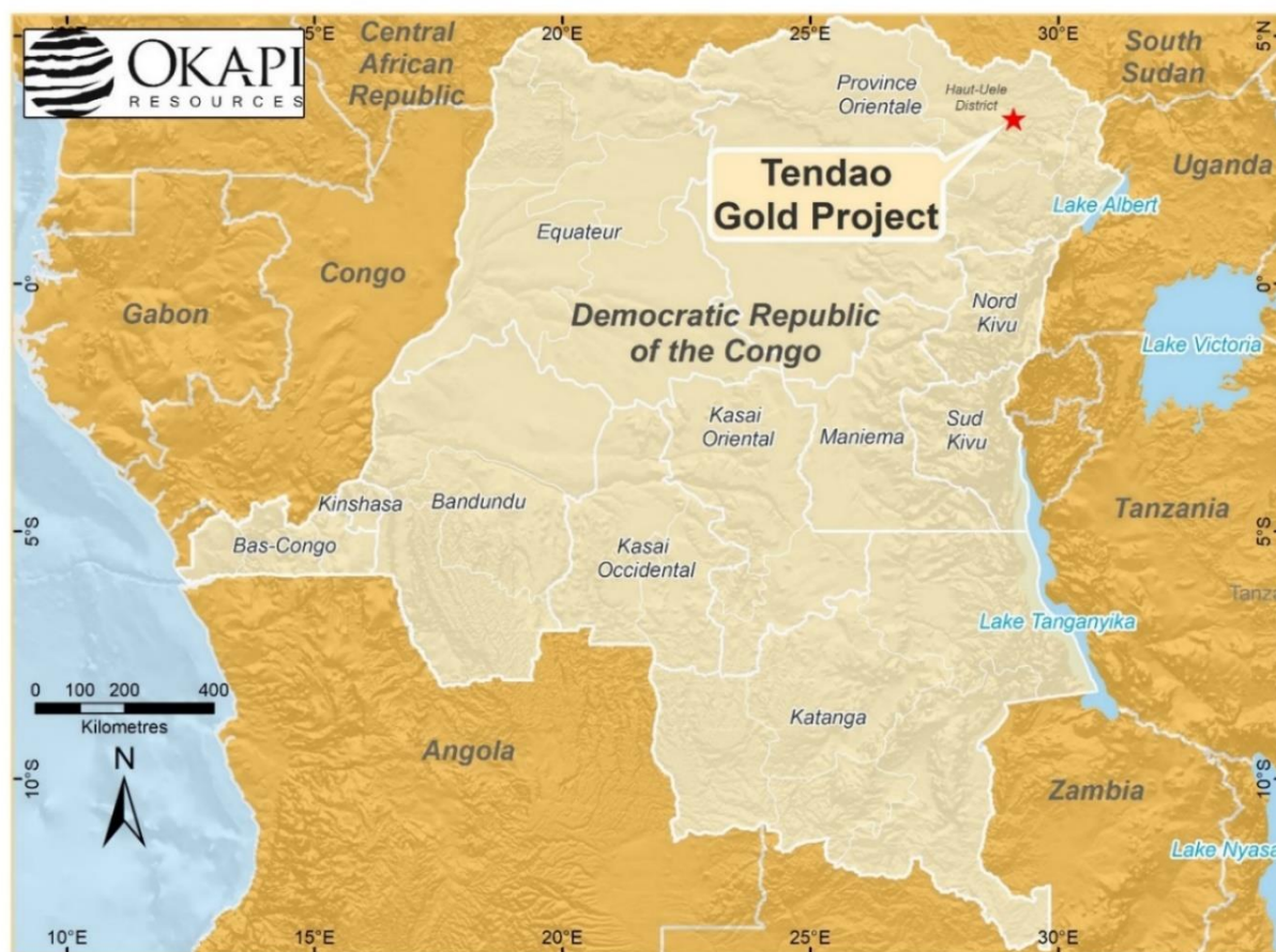
Figure 2: Tendao Gold Project Location Map